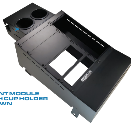
FRONT MODULE WITH CUP HOLDER SHOWN

FINISH: Black MATERIAL: ABS WARRANTY: Limited Lifetime